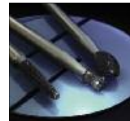
Robot ® Diamonds