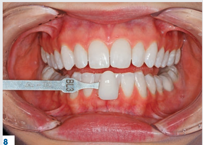
[ Figs. 1-8 ] One-touch operations on a large 3.5 inch LCD Touch Screen (Fig. 1). 8 Pre-Set Dental Shooting Modes (Fig. 2). Full Face Photo (Fig. 3). Retracted Smile – Notice the depth of field all the way back to the posterior (Fig. 4). Right Buccal shot, upper and lower teeth together focusing on the Right Buccal in the center of the frame (Fig. 5). Left Buccal shot, upper and lower teeth together focusing on the Left Buccal in the center of the frame (Fig. 6). Isolate Shade – You can isolate the teeth shade, graying out the gingival color for optimum shade matching capabilities (Fig. 7). Whitening mode - Allows for true color reproduction (Fig. 8).