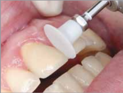
Does not crumble Disposable or reusable shank