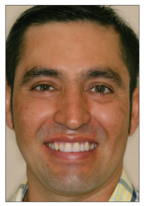
Figure 20. Full-face postoperative view of the patient's natural smile.

An updated treatment plan was developed that included a monochromatic buildup on teeth Nos. 7 to 9 to create the primary outline of the teeth in the aesthetic zone. Then, the illusion of tooth No. 10 would be created by placing a direct composite veneer on top of the palatally/lingually positioned tooth.