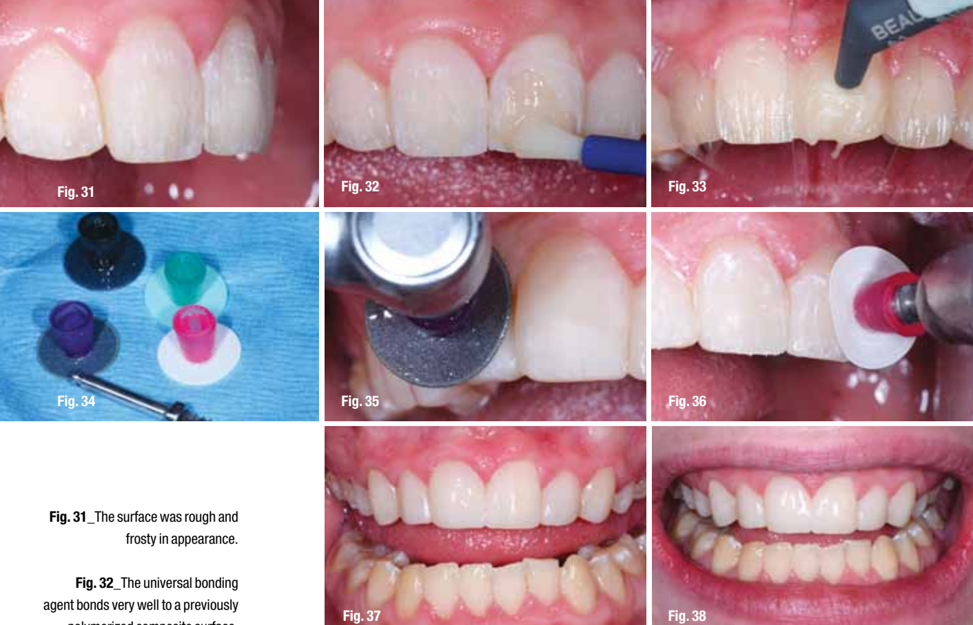
polymerized composite surface, is clear and has a very low film thickness.