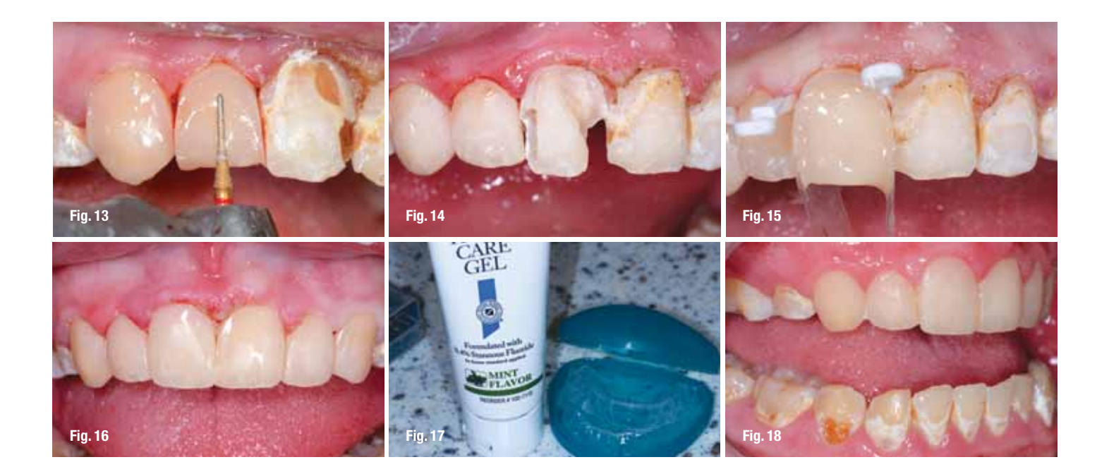
Fig. 13_Initial shaping was done with a finish diamond on high speed with water, making sure that the width and embrasures were adequate before restoring the adjacent teeth.