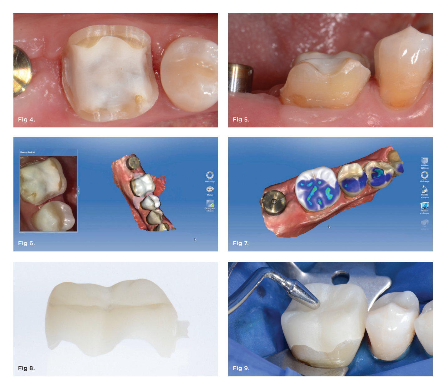
Fig 4. The abutment tooth was prepared according to guidelines for all-ceramic CAD/CAM restorations. Fig 5. Labial view of the preparation design. Fig 6. A digital impression was taken. Fig 7. The final restoration was planned digitally. digitally. Fig 8. Milled CAD/CAM composite resin material restoration. Fig 9. The restoration was checked for fit prior to cementation.

was air abraded with aluminum-oxide particles with a particle size of 50 µm (Figure 10). The restoration was cleaned using alcohol and a silane (GC Ceramic Primer, GC Corp.) applied to the bonding surface. Subsequently, the abutment tooth was prepared for bonding (Figure 11). The enamel was selectively conditioned. The tooth was rinsed and dried, and a desensitizer (Telio CS Desensitizer, Ivoclar Vivadent) was applied to the dentin areas. An adhesive (Scotchbond<sup>™</sup> Universal Adhesive, 3M ESPE) was applied to the restoration and the tooth surfaces, and the restoration was cemented using a resin cement (RelyX<sup>™</sup> Ultimate, 3M ESPE). The restoration was checked for occlusal and proximal contacts and subsequently polished (Figure 12 and Figure 13). Figure 14 and Figure 15 show the final restoration on the day of bonding, and Figure 16 demonstrates the restoration 1 year later.