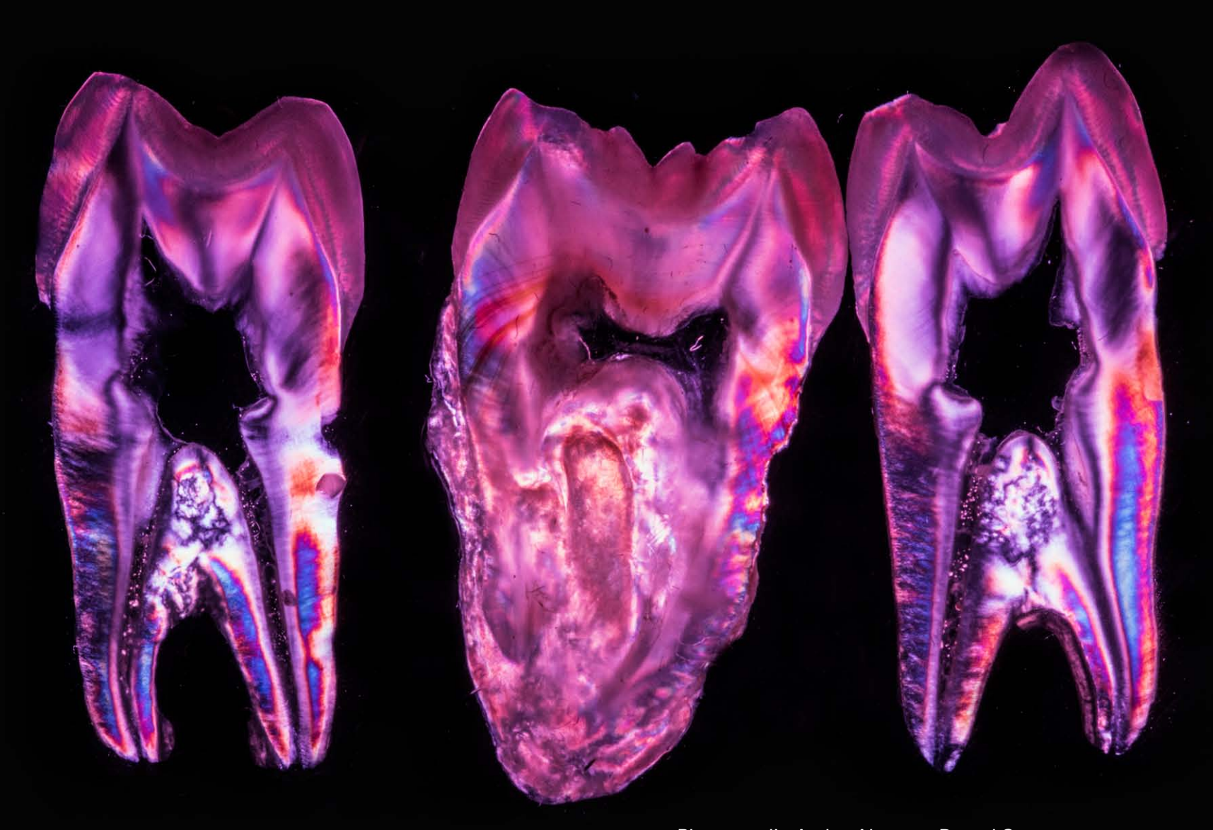
An intimate look into a microscopic world