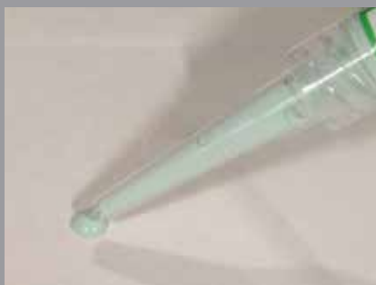
One: Remove cap from syringe and attach the delivery tip