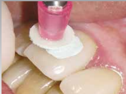
Three: Polish and clean natural teeth. High luster polish on restorative materials

DirectDia Paste is perfect for polishing natural teeth or restorative materials including porcelain, direct composite and metal. It is designed for a quick polishing and patient acceptance with a palatable lime flavor. DirectDia Paste does not require a dry surface and always stays on the tooth during polishing, yet washes off easily.