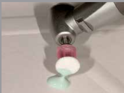
Two: Apply a small quantity of paste to a Super-Snap® Buff disk