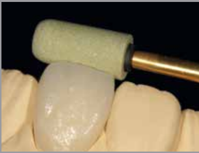
CY5 - No. 70: Surface Adjustment Effectively adjust the surface of the crown due to the excellent cutting performance