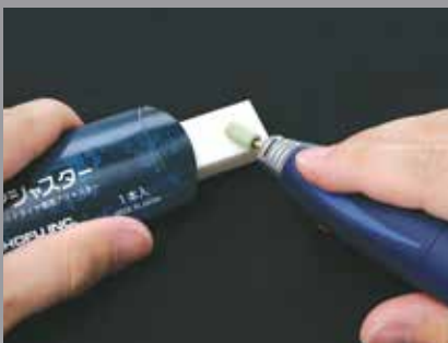
Press Dura-Green DIA against the Shofu Adjuster while rotating the abrasive