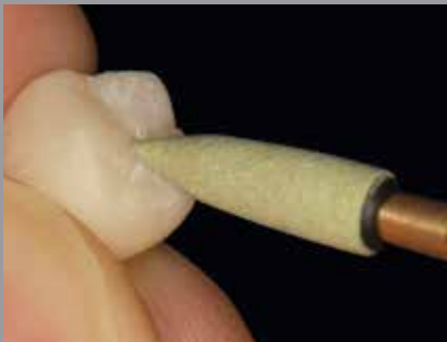
TC4 - No. 20: Detailed Finishing Ideal for adjusting the ridges and occlusion