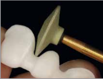
KN7 - No. 10: Framework Adjustment Adjust the thickness of porcelain and ceramic copings