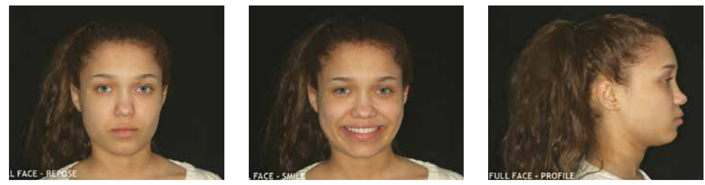
Figure 4: a series of orthodontic face images, repose (left), smile (middle), and profile (right), photographed against a nonreflective, dark background.

have longer, tapered handles, while double-ended retractors provide both a small and a large curvature, allowing for more adaptability and maneuvering.