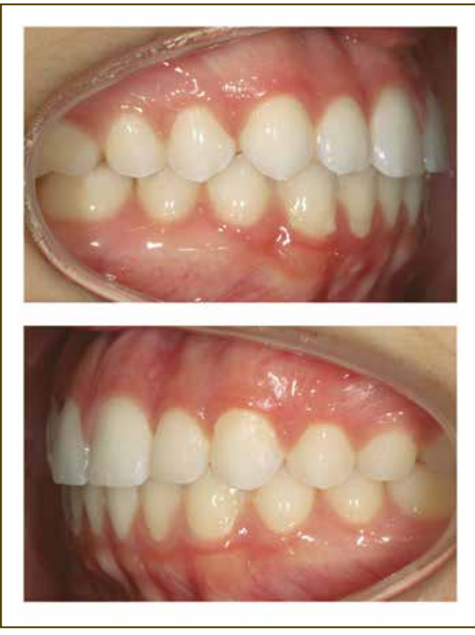
Figure 3: a series of retracted images captured for the orthodontic series: Right Buccal, Frontal, and Left Buccal.

Dental photography requires strict adherence to infection control protocols. All photographic equipment, including the body of the camera, lens, flash, tripod, and cable releases, should be draped with films, barriers, or disposable covers. Cheek and lip retractors should be either autoclaved or cold-sterilized, depending on the manufacturer's instructions. Intraoral mirrors and contrastors should be cleaned and disinfected carefully with a mild surface disinfectant to avoid smearing and damaging of their delicate coating. To avoid