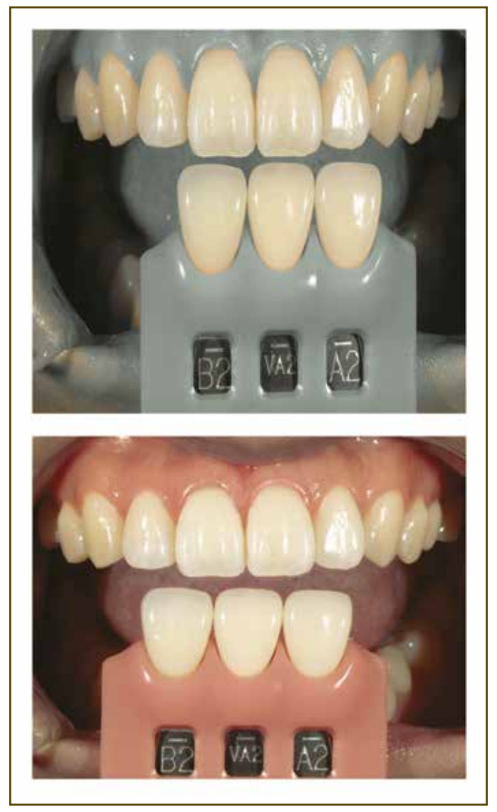
Figure 1: Shofu EyeSpecial C-II digital dental camera includes the Isolate Shade mode, which grays out the gingival tissue for optimal shade matching.