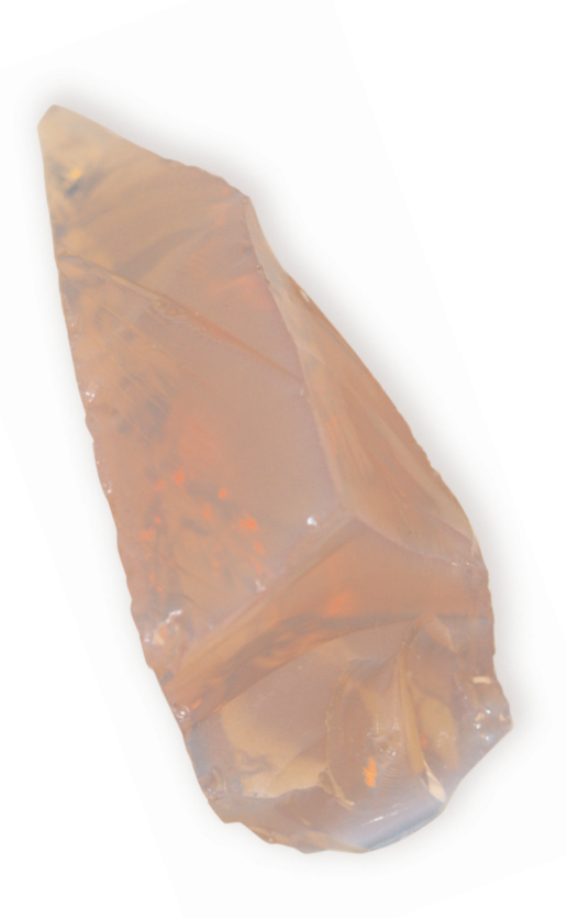
PURE opal frit - observe the clarity