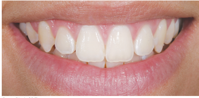
Peter Pizzi, CDT

Achieve pure aesthetic metal-free restorations utilizing any Zirconium oxide framework – a growing trend.