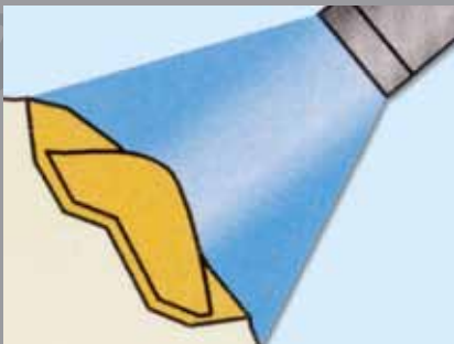
Three: Light-cure for 20 seconds. Ready for composite.

Cerarasin Bond can be used to modify porcelain restorations quickly and efficiently with light-curing materials. Cerarasin Bond combines cold-curing resins with light-curing veneering material as well as different light-curing veneering composites. Also there are no limits to individualizing denture teeth with light-curing veneering material.