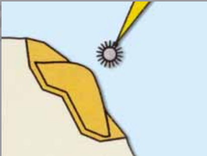
Two: Apply Cerarasin Bond 2. Leave for 10 seconds.